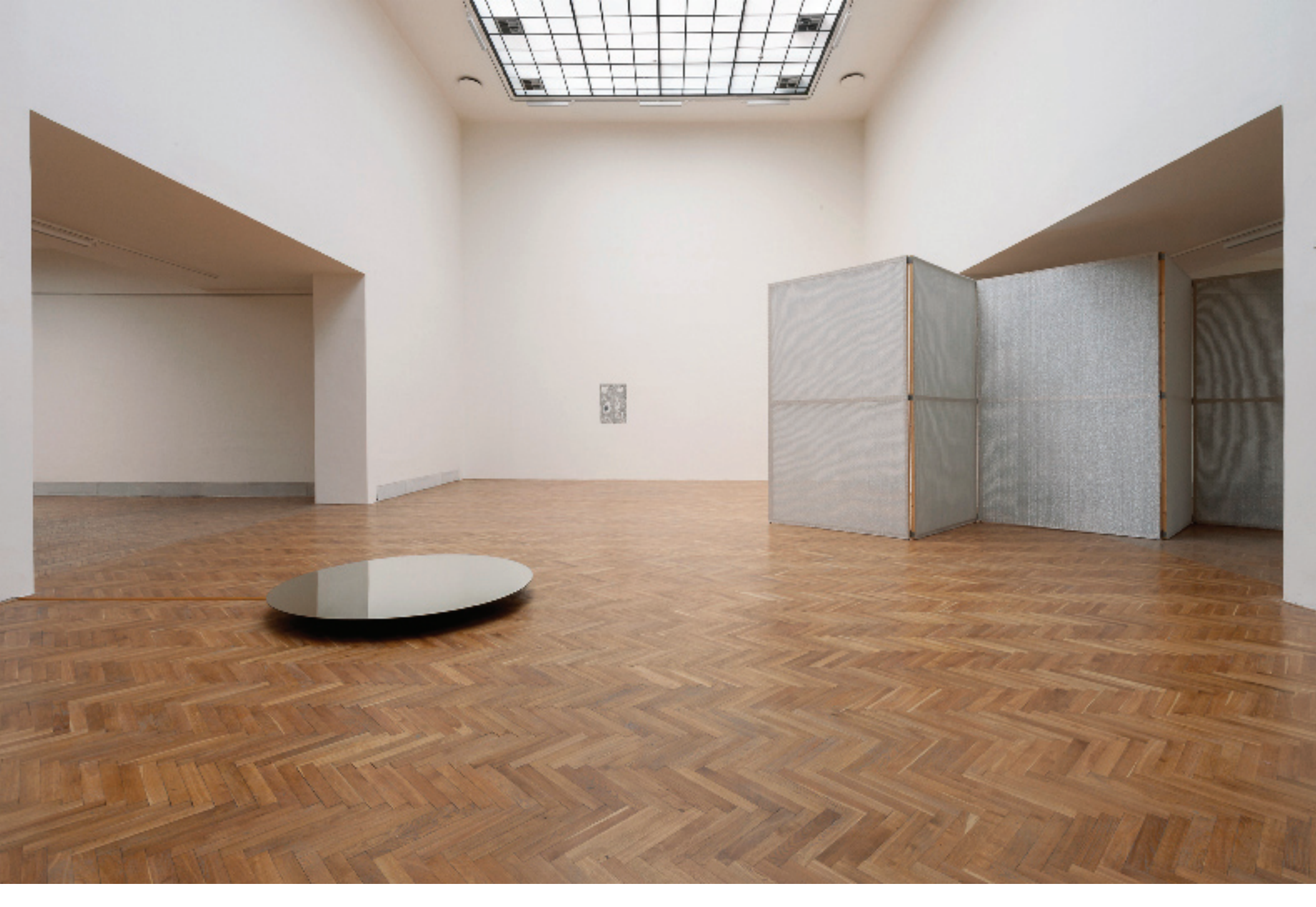
Rotating Circular Mirror, Installation view "The Art of Diminished Difference" The Brno Hause of Arts, 2020 (Karin Sander, Wall Piece, 2020, Heimo Zobernig, Stage Mesh Paravan, 2020)